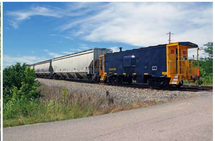
It's not too often these days you see a caboose running down the rails at the end of a train. On June 24, 2012 in the afternoon an ex-Conrail Caboose CR 24012 sporting a brand new paint job rolled past the old L&N Railroad Station at Madisonville, Ky as it headed North toward Evansville on CSX's Henderson Subdivision.