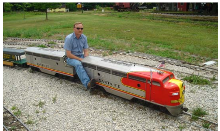
Above: Who's your "chief" ? This guy is. One of the Hesston Steam Museum volunteers operates a matched Santa Fe A-B pair of F7's on the museum's 1/8 scale railroad, hauling kids and kids-at-heart on a mile long loop of track.

Right: A beautiful 1/8 scale 4-4-0 American type gets a little attention during a station stop at Hesston Junction before departing with the next scheduled "advertised". Although the full-scale Shay was in the shop on this day, this little 15-horsepower steam locomotive puts on quite a show for the crowd at the Hesston Steam Museum.