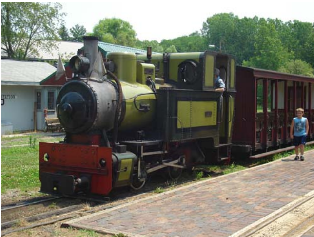
Above: Mecklenburg Pommersche Schmall Spurbahn Railroad 0-4-0 provides the normal weekend power for the two-foot gauge steam operations at Hesston Steam Museum. Seen here on June 30, 2012, the little steamer is ready to pull passengers on the two mile loop around the museum grounds.

Hesston keeps the memory of narrow gauge steam railroads alive. If you're a steam fan or long to relive your days of youth at your favorite amusement park, you'll love the sights, sounds and smells as you ride over hills, past lakes, and through farm fields on a two and a half mile journey back in time. You'll love it!